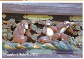
"See no evil, hear no evil, speak no evil"

Located in the northern mountain range of Kanto plain, Nikko is blessed with beauty of nature, water and forest areas; you can enjoy beautiful scenery of four seasons around Lake Chuzenji , and the Oku-nikko-shitsugen area inscribed as a registered wetland under the Ramsar Convention, including Lake Yuno-ko , River Yugawa , Senjogahara , and Odasirogahara . Additionally, the building complex consisting of a total of 103 buildings (nine of which are registered as Japan's national treasures and 94 the important cultural properties) belonging to Toshogu shrine, Rinnou-ji temple, and Futarasan shrine on Mt. Nantaisan and the historic monuments around the area are UNESCO's world cultural heritage. Nikko is a spiritual area, where great beauty of nature and historic temples and shrines coexist in accord, where people can feel their spirits cleansed, and where spiritual culture still exists which Japanese people have cherished since ancient times.