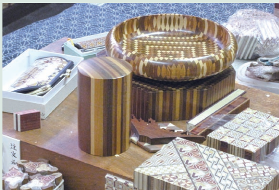
A variety of yosegi-zaiku

To make a yosegi-zaiku wooden pieces of different colors and grains are assembled and glued together to form patterned units, and they are combined to make beautiful larger patterns. Sometimes the patterned wooden pieces could be carved into bowls, trays, and so on, but they are usually shaven using Japanese plane ( kanna ) into thin sheets of approximately 0.2 mm thick and pasted on the surfaces of ordinary wooden boxes, etc.