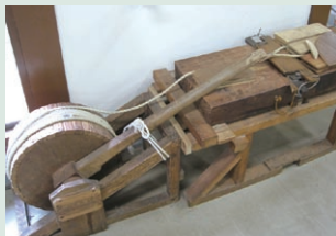
Japanese plane ( kanna )

Yosegi-zaiku is a kind of wood mosaic works which express geometrical patterns by combining and assembling natural wood materials of various colors and grains. While this kind of wood craft is widely found elsewhere in the world, in Japan yosegi-zaiku has especially been produced in Hakone area, Kanagawa Prefecture, and has come to be a well-known traditional handicraft.