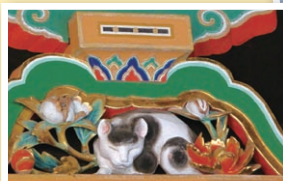
A famous sculpture, "a sleeping cat"