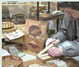
Shaving the surface